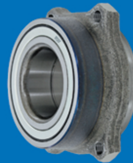
Wheel Bearing & Mounting Flange

*Part shown is SPKT002; other part numbers may differ