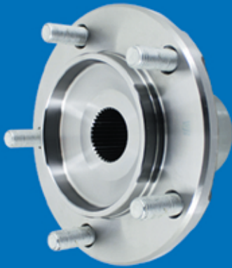
Wheel Hub Spindle

These specially designed assemblies have all necessary seals, bolts, c-clips, and other miscellaneous components already pre-installed into one singular unit, allowing the replacements of wheel hubs and bearings to be as simple as bolting off the original part and bolting on the new WJB assembly.