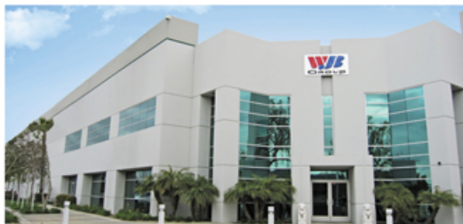
Headquarters & Warehouse in California

With professional sales, engineering, and support teams across North America assigned to each of the major sectors, WJB ensures that every customer's needs are being taken care of. WJB is committed to creating values and benefiting customers through the constant development of bearing types and numbers, improvement of the service and quality control process, and expansion of logistics and distribution capabilities. Contact WJB for a cost efficient solution that is customized to meet your needs.